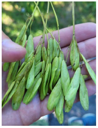
Black Ash Seed