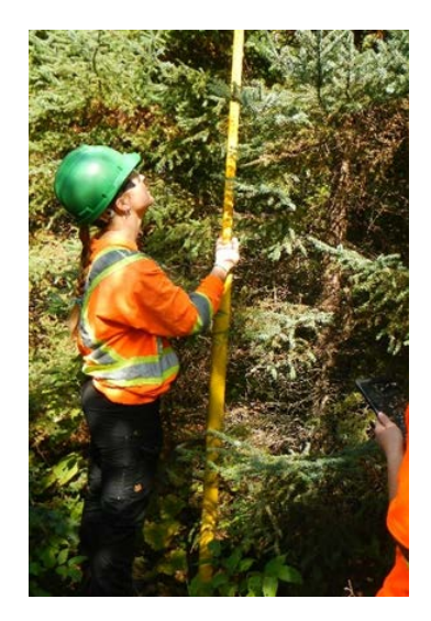
Measuring Tree height