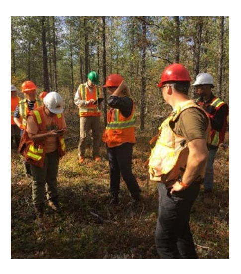
2023 Kenogami Forest IFA field portion

As shown in Table 1, the process identified a number of findings in all four (4) audits. All four (4) reports have now been accepted by the Ministry. Detailed action plans to address the findings presented in the audit reports are being prepared and will be posted on the Ontario government website alongside the audit reports.