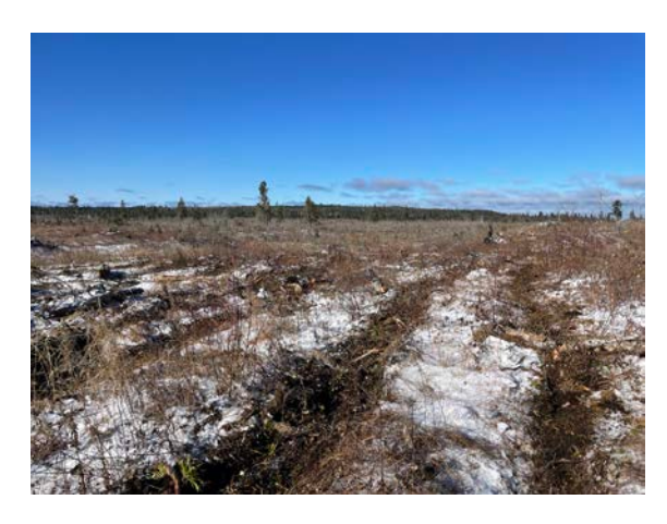
1173-2-R56 - Lofty Davies Stand Remediation on the Lakehead Forest

In 2021-22, the FFTC began collecting and reporting on the number of employment days that were generated from its silviculture projects. In 2023-24, 47 projects gave rise to approximately 10,938 days (based on an 8hour day) and 16 projects could not be initiated and reported zero days of operations. This represents a decrease of about 22% from last year's data for which 46 projects reported 17,358 employment days and 4 projects reported zero. There were a variety of reasons for this apparent reduced employment levels but a shortage of available and experienced silviculture contractors was a major reason, along with poor hardwood markets that rendered stand improvement operations as economically unfeasible to conduct.