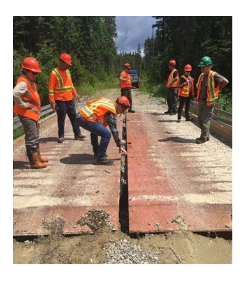
2023 Spanish Forest IFA field portion