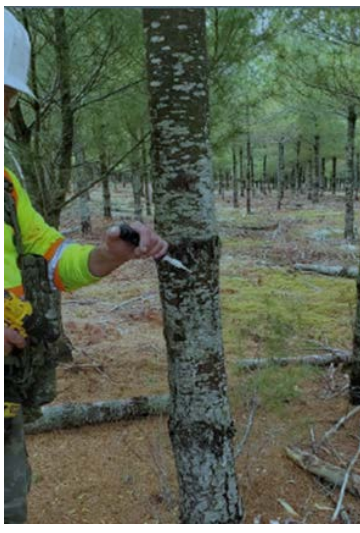
Injection of GA 4/7 in Gurd Orchard

Applicants are required to demonstrate how project proposals support strategic priorities described in this document. The strategic plan is designed as an interim document pending any updated strategic policy direction that Ontario may develop for the FGRM Program. The strategic plan will be pilot tested during the 2024-25 application process for FGRM Core and Project-Based Activities and then updated accordingly to improve its effectiveness.